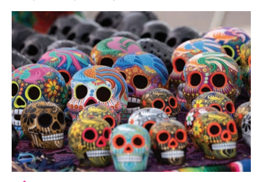
DÍA DE LOS MUERTOS FESTIVAL SAT, OCT 21 & SUN, OCT 22 10:00 AM - 5:00 PM