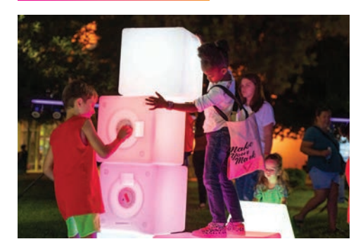
SEASON KICKOFF FESTIVAL FRI, SEP 8, 2023 | 6:00 - 10:00 PM