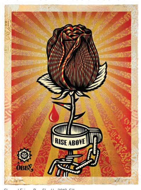
Shepard Fairey, Rose Shackle, 2019, Silkscreen and Mixed Media Collage on Paper, HPM, 30 x 41 inches.